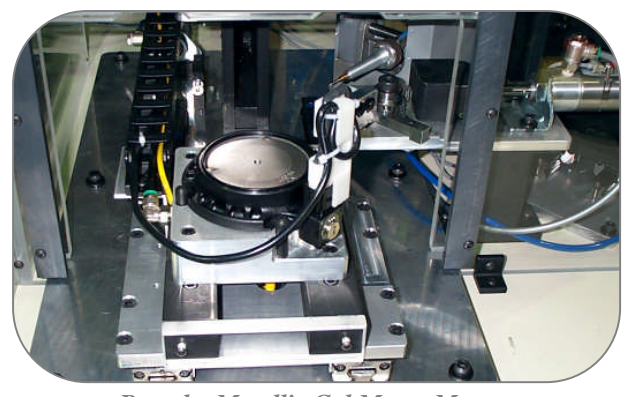
Porsche Metallic Gel Motor Mount Pressure, Leak and Electrical Test

We are continually developing and looking for new technology to address complicated problems. If it is a simple problem, we use a simple solution.