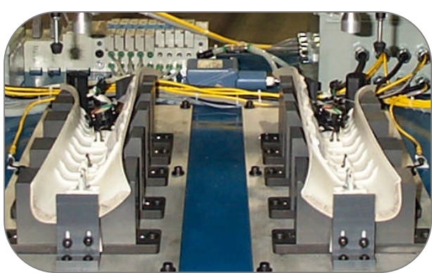
Ford A Pillar And Speaker Clip Installation, Hot Air Cold Stake