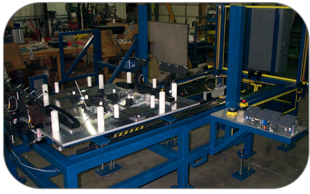
Mustang Roof Glass Panel Robotic Work Cell Glass Crowder and Bracket Urethane Wet Out