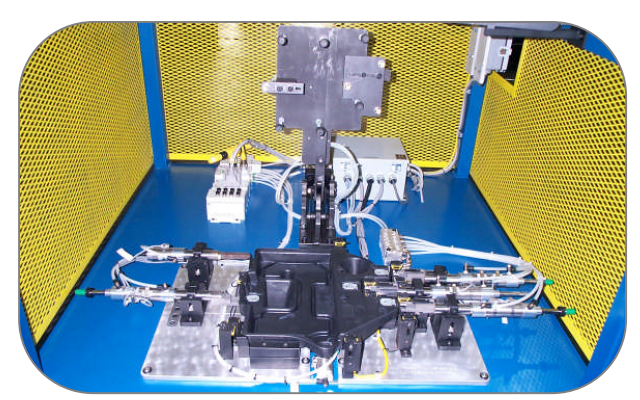
Battery Tray Install Clips and Degate Part Base/Cube<sup>TM</sup> System

The Base/Cube™ System provides the latest modular lean manufacturing technology. Our patented system separates capital equipment from your customers assembly equipment. Bases contain the expensive controls and safety equipment required for all equipment. Cubes are the function or the contact part of the machine unique to each assembly operation. All Bases will work with any Cube. Cubes are stackable to free up valuable floor space. The Base/Cube™ System can save you more than $15,000 on every machine.